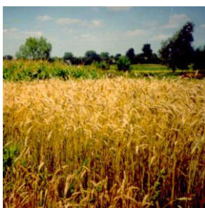
Winter rye "Drevlyanske"

His achievements in the area of selection, which is a distant from medicine area, are striking. A technology of obtaining of new forms of plants with desired economic properties is created using the approach of structural modification of molecules-carriers of hereditary information DNA and RNA - was invented under his guidance. These achievements' wide application has a considerable economic and social effect, in particular, for environmental recovery, obtaining of heavy yield on highly saline and nitrogen-depleted soils, and also during the hydroponic growing with the use of seawater without its desalination.