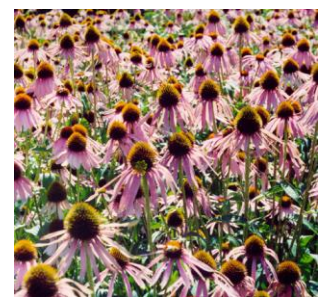
Purple Echinacea "Beauty of Polissya"

Figures represent new varieties of plants created by the new technology of A.I. Potopalsky and his colleagues. Plants are resistant to unfavorable conditions and approved by State Inspection of Plant Varieties of Ukraine.