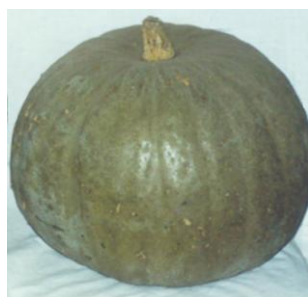
Pumpkin "Kavbuz Zdorovyaga"